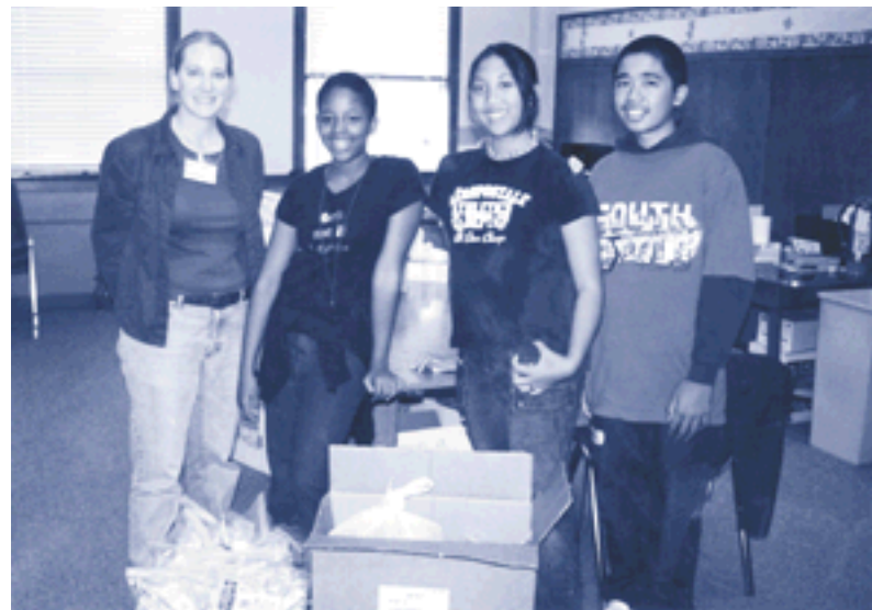
Students help pack donations for clients of the Champion Guidance and Visitation Centers in Oakland.

In addition to collecting donations, many students created cards, wrote notes, or copied Bible verses and included these words of encouragement in the bags of supplies. Most schools also donated large bottles of lotion, shampoo, and the like, many of which were included in holiday packages for needy families.