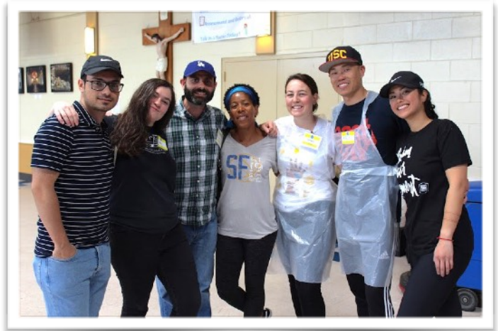
THE OAKLAND VOLUNTEERS SERVE IN OUR DINING ROOM ONCE EVERY MONTH, AND DISTRIBUTE HYGIENE KITS THROUGHOUT THE CITY THE WEEKEND FOLLOWING THEIR DINING ROOM VISIT.