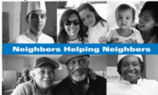
Neighbors Helping Neighbors

Drop your BART ticket with any unused value here, to support meals, training, clothing, & other services for low-income families in Alameda County.